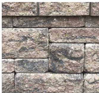
BROWN BEIGE CHARCOAL