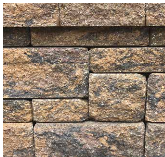
TAN BROWN CHARCOAL

Due to the natural materials in our products, colors may vary from those shown on the cut sheet. We recommend viewing actual product samples to ensure the perfect color and finish for each project.