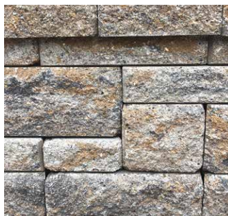
GRAY CHARCOAL TAN