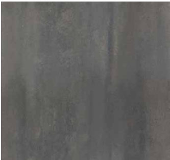
SHADED GREY BC Only