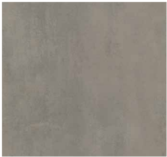
SCANDINA GREY BC Only