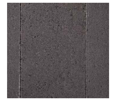
M | D N | G H T Only available in Manitoba