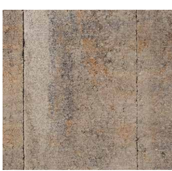
VICTORIAN Not available in Manitoba