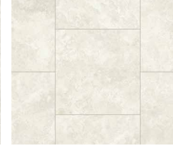
PEARLY CROSS EY 12 NAT Only available in 32 x 32