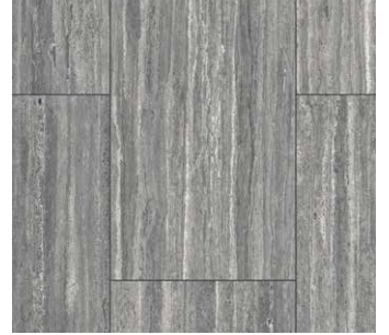
DARK VEIN EY 08 NAT Only available in 24 x 48