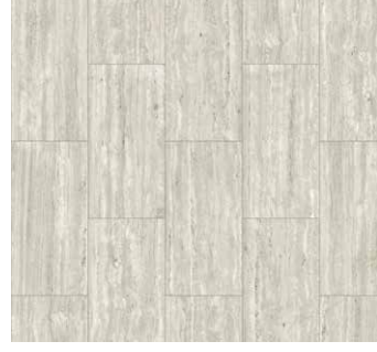
MISTY VIEN EY 11 NAT Only available in 24x48