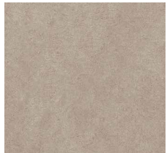
v2 LAND NM 05

Due to the natural materials in our products, colors may vary from those shown on the cut sheet. We recommend viewing actual product samples to ensure the perfect color and finish for each project.