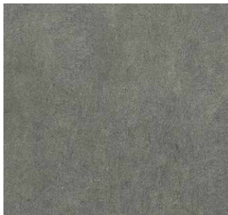
v2 WIND NM 02