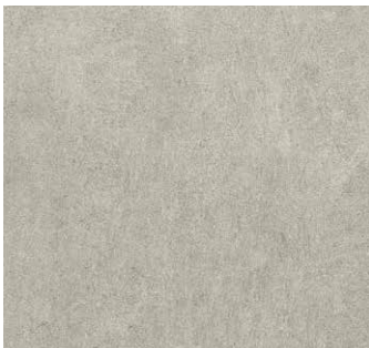
v2 RAIN NM 01