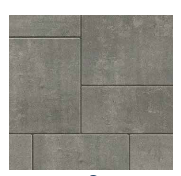
SHADED GRAY 🤝