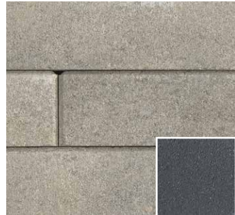
SCANDINA GRAY / MIDNIGHT