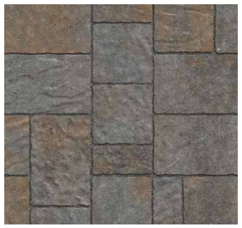
A V O N D A L E IR O N B A Y