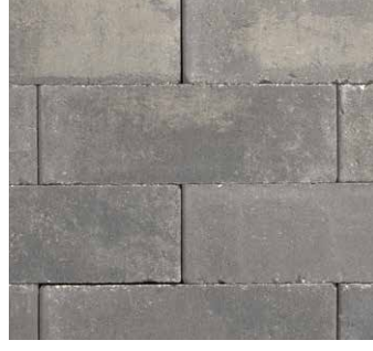
AMARETTO NAPOLI SLATE