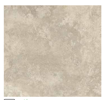
LIGHT CROSS EY 13