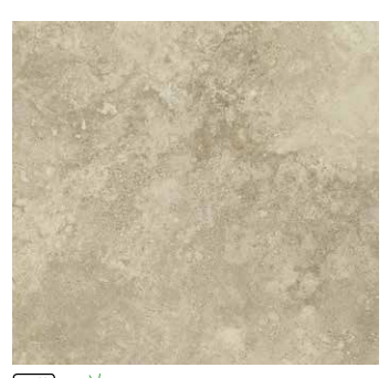
RUSTIC CROSS EY 15