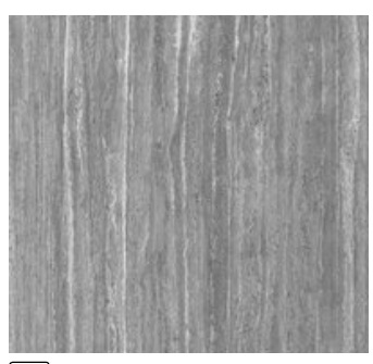
DARK VEIN* EY 08