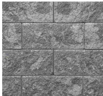
OXFORD Swatch represents color only.

Due to the natural materials in our products, colors may vary from those shown on the cut sheet. We recommend viewing actual product samples to ensure the perfect color and finish for each project.