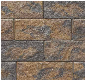
BRITTANY BEIGE Swatch represents color only.