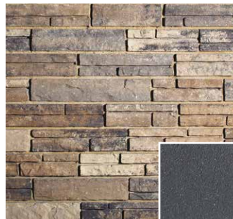
SIENNA / MIDNIGHT

Due to the natural materials in our products, colors may vary from those shown on the cut sheet. We recommend viewing actual product samples to ensure the perfect color and finish for each project.