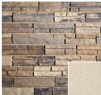
SIENNA / BUFF