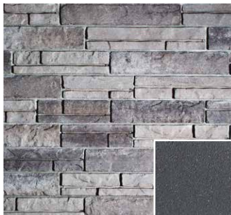
PEWTER / MIDNIGHT