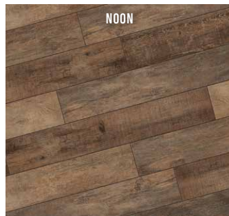
NOON v3 HONEY NN 03 ST