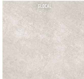
GLOCAL v2 CLEAR GC 01