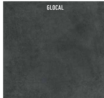
GLOCAL v2 ABSOLUTE GC 06