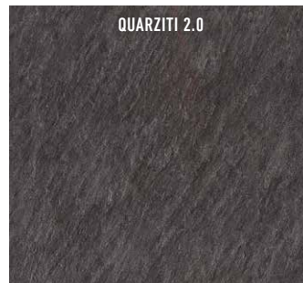
QUARZITI 2.0 v3 MANTLE QR 05 NAT

Due to the natural materials in our products, colors may vary from those shown on the cut sheet. We recommend viewing actual product samples to ensure the perfect color and finish for each project.