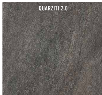
QUARZITI 2.0 v3 RIVER QR 04 NAT