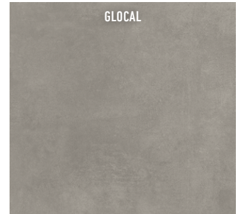
GLOCAL v2 IDEAL GC 03