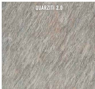
QUARZITI 2.0 v3 WATERFALL QR 03 NAT