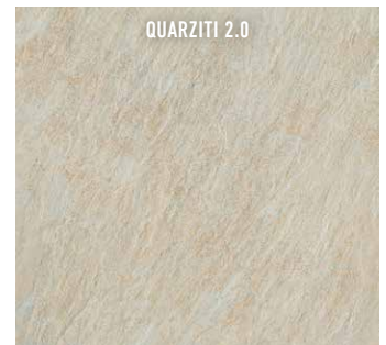
QUARZITI 2.0 v3 MOUNTAINS QR 02 NAT