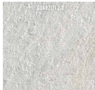
QUARZITI 2.0 v3 GLACIER QR 01 NAT