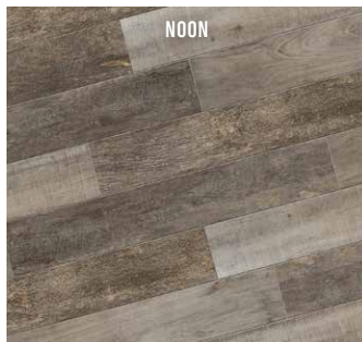
NOON v4 EMBER NN 02 ST