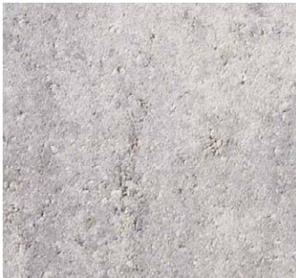
M | D N | G H T Only available in 6 x 36