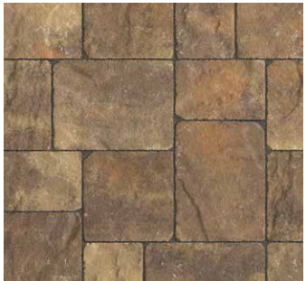
RUSTIC YELLOWSTONE 🐬