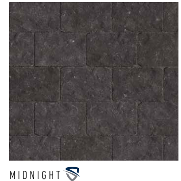
Only available in 6 x 9