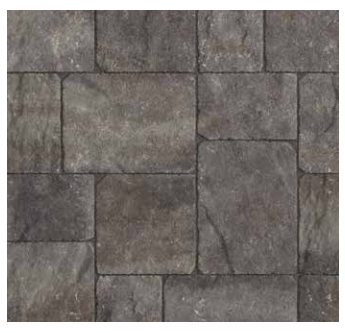
SIERRA GRANITE 🐬