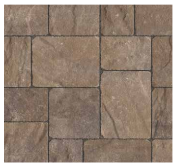
CAMERON CREAM 😽