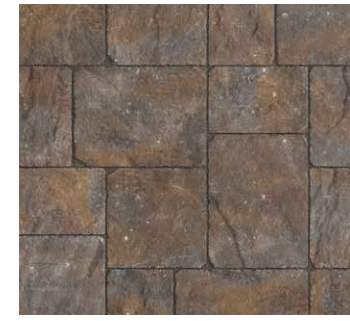
OAK BARREL 🐬