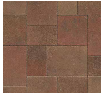
TAN RED CHARCOAL

Due to the natural materials in our products, colors may vary from those shown on the cut sheet. We recommend viewing actual product samples to ensure the perfect color and finish for each project.