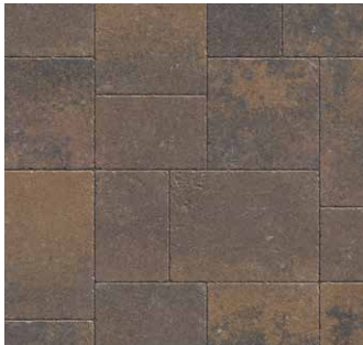
TAN BROWN CHARCOAL