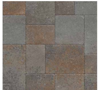
GRAY CHARCOAL TAN