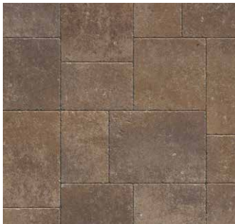
CREAM TAN BROWN