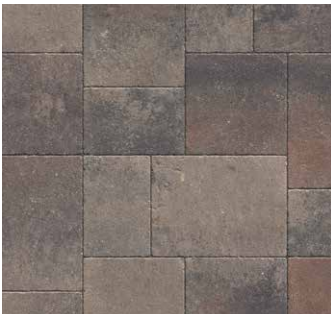
BROWN BEIGE CHARCOAL