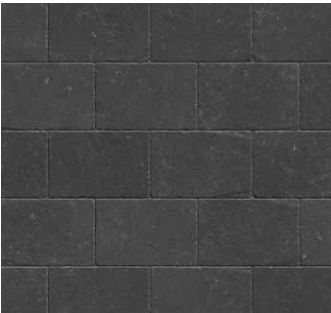
MIDNIGHT Only available in 6 x 9