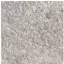
v2 VIT RR 01 ST - STA