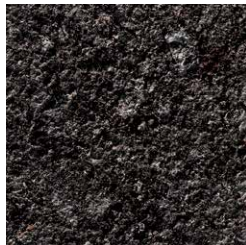
v2 SVART RR 03 ST - STA