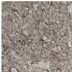
v2 GRA RR 02 ST - STA