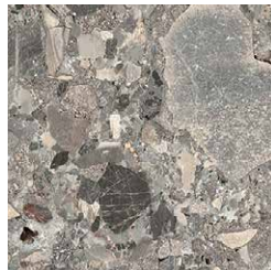
v3 FARGE RR 05 STA