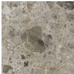
v4 OKEN* RR 08 STA