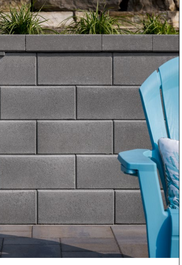
*Gravity wall heights are based on project specific conditions and may be lower than this value. Check with your local Belgard Representative for product availability and color options.