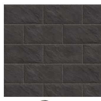
MIDNIGHT ST Only available in 6½ x 13