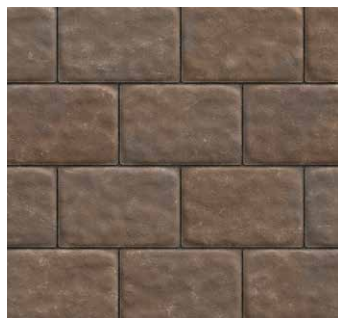
DAKOTA BLEND 🐬