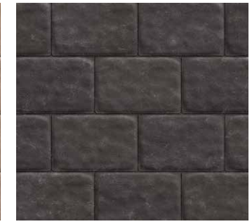
MIDNIGHT 🔊 Only available in 6 x 9