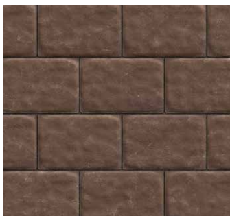
B R O W N S Only available in 6 x 9