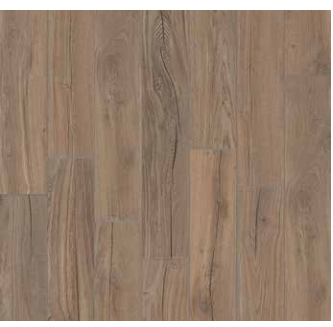
V2 CAMP JP 04