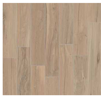
MASTER JP 03