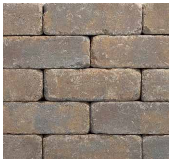
TOSCANA Only available in 3-piece