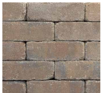
B E L L A Only available in 3-piece