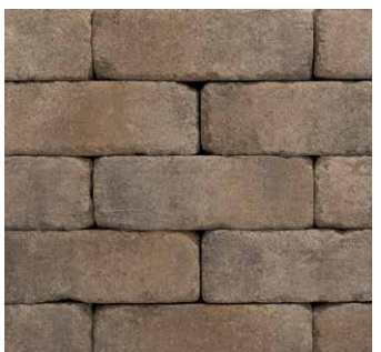
CREAM TAN BROWN Only available in Universal