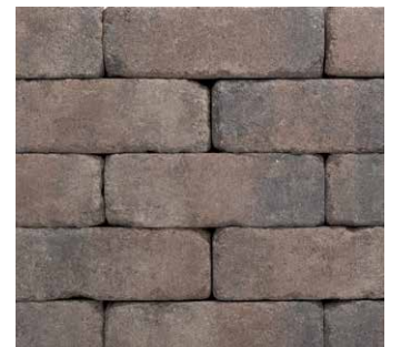
BROWN BEIGE CHARCOAL Only available in Universal