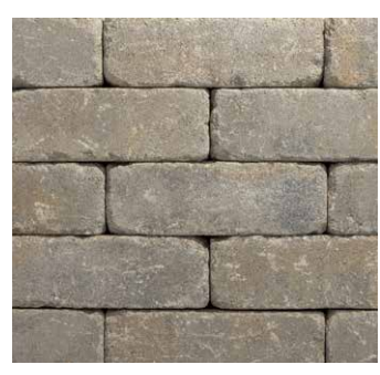
VICTORIAN Only available in 3-piece