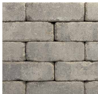
RIVIERA Only available in Universal