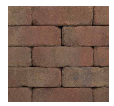
TAN RED CHARCOAL Only available in Universal