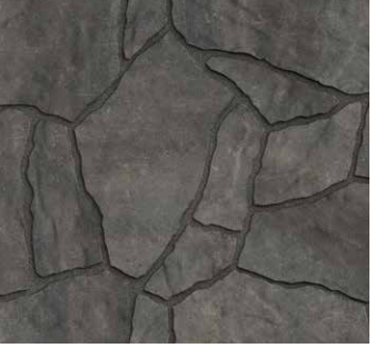
ASPEN NEWPORT GRAY