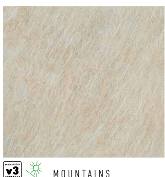
MOUNTAINS QR 02 NAT