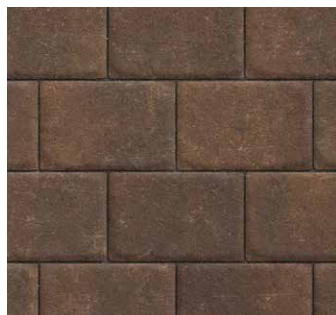
HARVEST Only available in 6 x 9