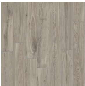
v2 COOL JP 02