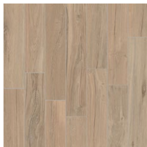
v2 MASTER JP 03