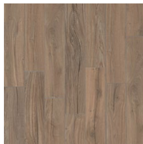
v2 CAMP JP 04