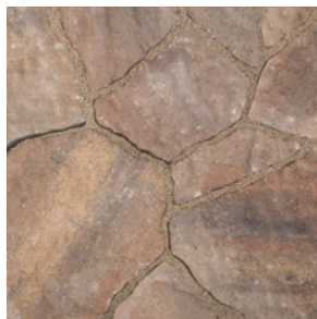
ASHBURY HAZE (ACCENT)