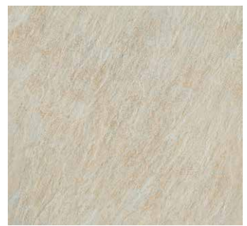
MOUNTAINS QR 02 NAT