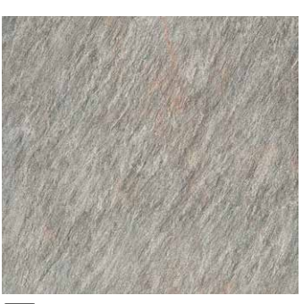
WATERFALL QR 03 NAT