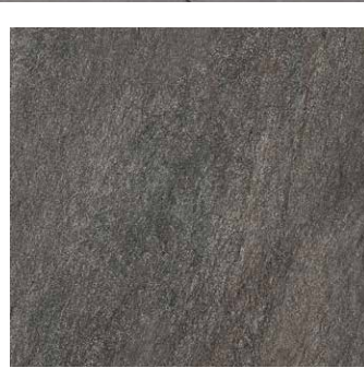
RIVER QR 04 NAT