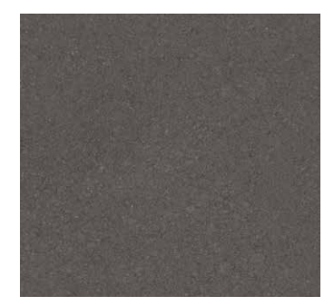
G R A P H I T E Only available in 6 x 9