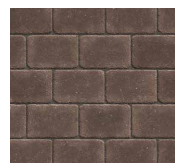
B O U R B O N Only available in 6 x 9