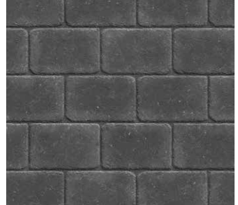
M | D N | G H T Only available in 6 x 9