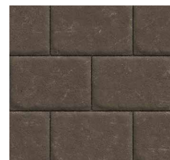
B O U R B O N Only available in 6 x 9