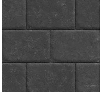
M | D N | G H T Only available in 6 x 9