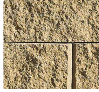
DESERT BLEND Not available in XL Cap