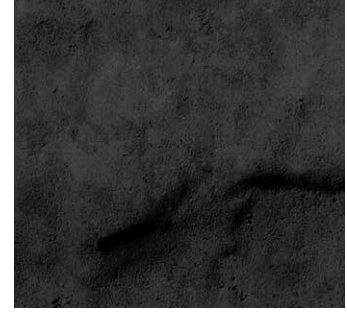
\mathsf{C}\,\mathsf{H}\,\mathsf{A}\,\mathsf{R}\,\mathsf{C}\,\mathsf{O}\,\mathsf{A}\,\mathsf{L} Only available in Cap. Swatch represents product color only, not size or shape.