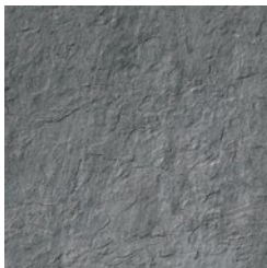
v3 VULCAN* AD 05 NAT