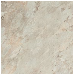
v3 SHORE* AD 01 NAT