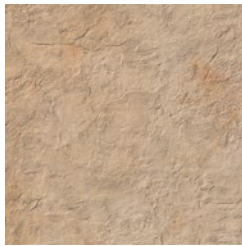
v3 ISLAND AD 02 NAT