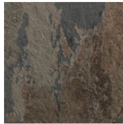
v4 AFRICAN STONE AD 03 NAT