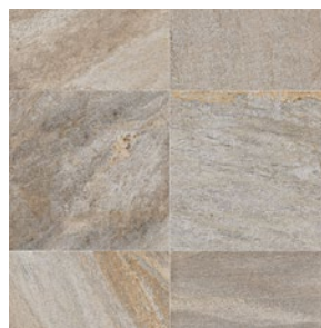
v3 MODERATE ORSI SK 06 ST