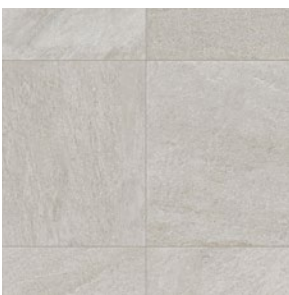
v3 MODERATE BRAIES SK 01 ST