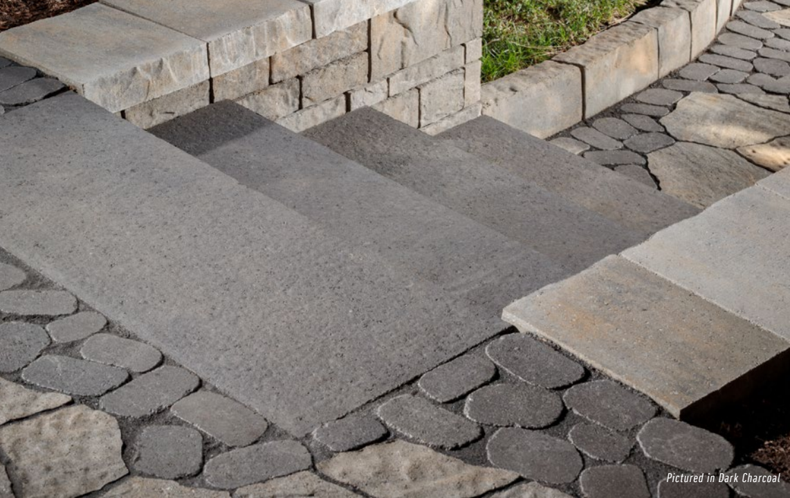
Pictured in Dark Charcoal