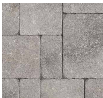
ARCTIC Only available in 3-piece