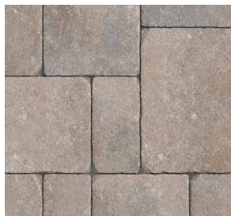
SAVANNAH Only available in 3-piece

Due to the natural materials in our products, colors may vary from those shown on the cut sheet. We recommend viewing actual product samples to ensure the perfect color and finish for each project.