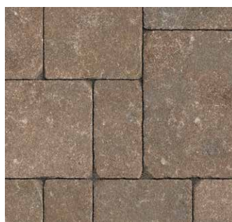
FOSSIL Only available in 3-piece