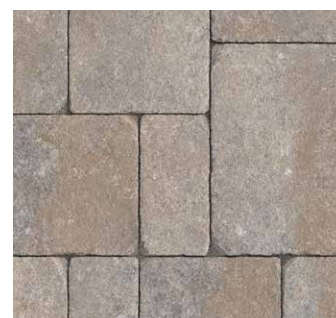
HATTERAS Only available in 3-piece