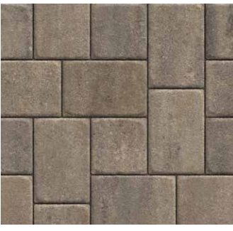
A V O N D A L E Only available in 2-piece