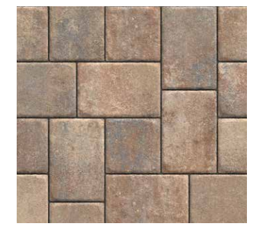
S A V A N N A H Only available in 2-piece