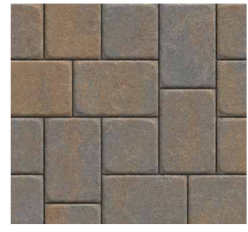
A P P A L A C H I A N Only available in 2-piece