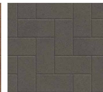
G R A P H I T E Only available in 60mm