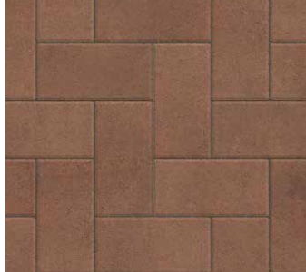
V A L E N C I A Only available in 80mm