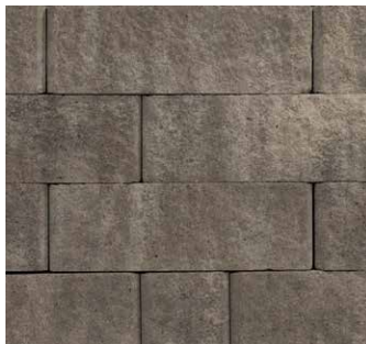
ASHWOOD Swatch represents product color only.