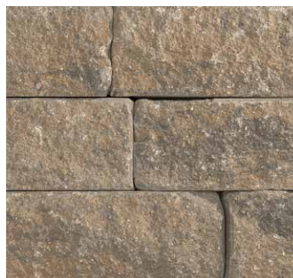
GASCONY TAN Only available in cap

Due to the natural materials in our products, colors may vary from those shown on the cut sheet. We recommend viewing actual product samples to ensure the perfect color and finish for each project.