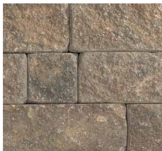
ASHBURY HAZE Only available in cap