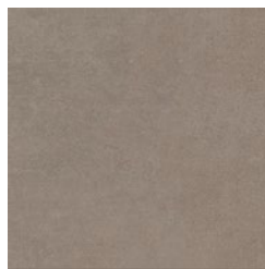
v2 CHAMOIS* GC 08

*Special order ** Clear not available in 48 x 48