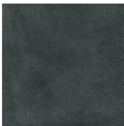
v2 ABSOLUTE* GC 06