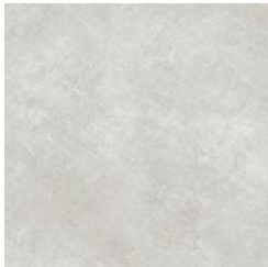
v2 CLEAR** GC 01