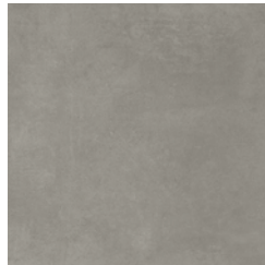
v2 IDEAL GC 03