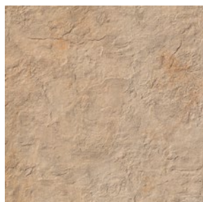
v3 ISLAND* AD 02 NAT