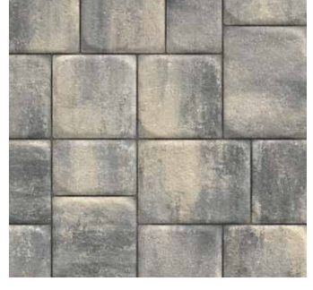
N A P O L I T I T A N I U M