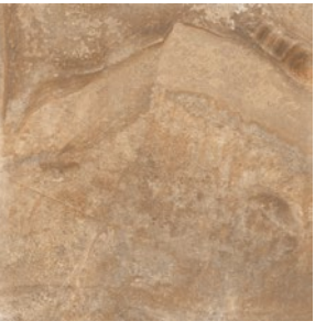
TAOS* VR 02 ST

*Contact your Belgard® representative for availability and lead times. **Only available in Blue Stone.