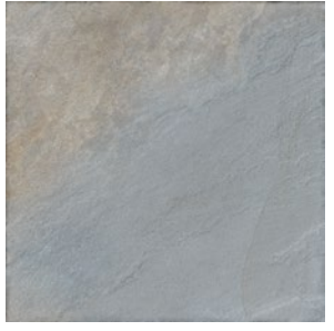
BLUE STONE VR 01 ST