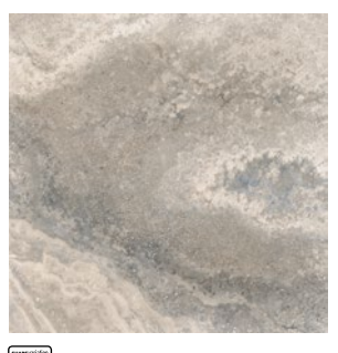
v3 PLATINUM VR 04 ST