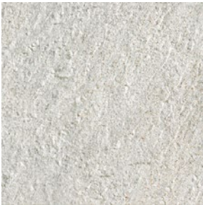
v4 GLACIER QR 01 NAT