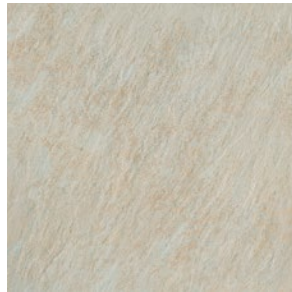
v3 MOUNTAINS** QR 02 NAT