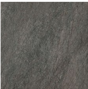
v3 RIVER** QR 04 NAT

*Contact your Belgard® representative for availability and lead times. **Contact your Belgard® representative for availability in 24 x 48 sizing.