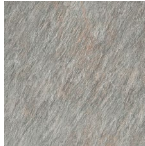
v3 WATERFALL QR 03 NAT