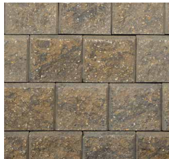
ROCKY MOUNTAIN BLEND