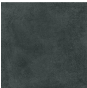
v2 ABSOLUTE GC 06