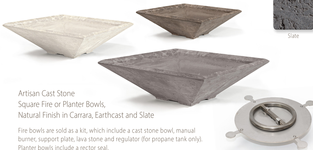
Artisan Cast Stone Square Fire or Planter Bowls, Natural Finish in Carrara, Earthcast and Slate

Fire bowls are sold as a kit, which include a cast stone bowl, manual burner, support plate, lava stone and regulator (for propane tank only). Planter bowls include a rector seal.