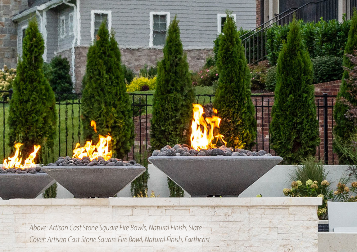
Above: Artisan Cast Stone Square Fire Bowls, Natural Finish, Slate Cover: Artisan Cast Stone Square Fire Bowl, Natural Finish, Earthcast