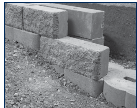
Diagram 3 – Stepping Up the Base