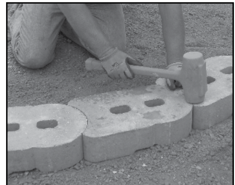
Diagram 2 – Base Course