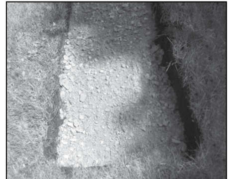
Diagram 1 – Leveling Pad

At this point, step up the height of one block and begin a new section of base trench. Use a 6-inch-high unit on the base course to level the base unit that is stepped up. See Diagram 3. Continue to step up as needed to top of slope. Always bury at least one full base block at each step-up.