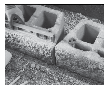
DIAGRAM 4 - LEVELING BASE COURSE