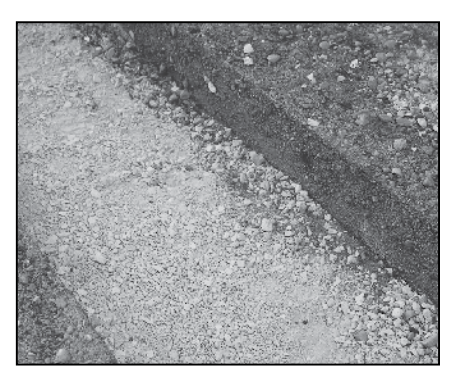
DIAGRAM 1 - EXCAVATION