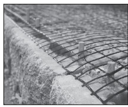
DIAGRAM 7 - REINFORCEMENT