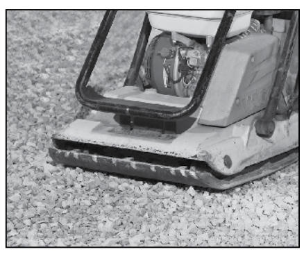
DIAGRAM 2 - LEVELING PAD