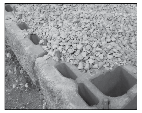
DIAGRAM 6 - CORE FILL